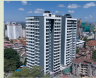
Oak Classic Residency 1&2 Bedroom Kilimani