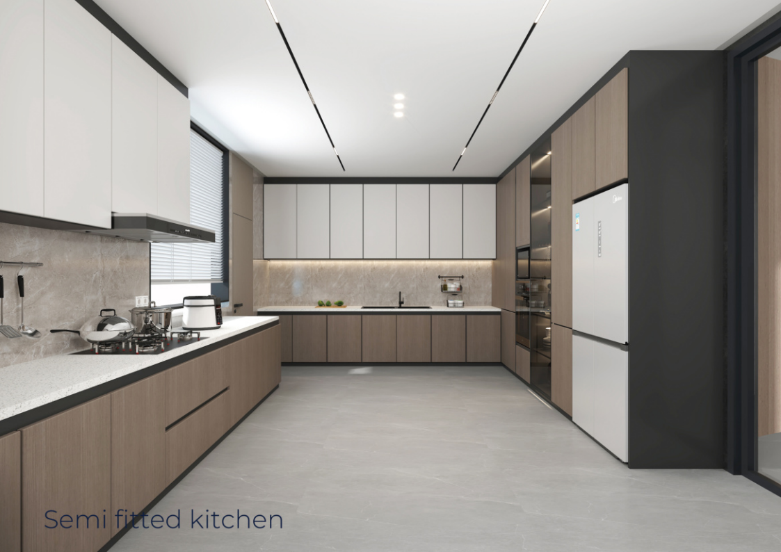
Semi fitted kitchen