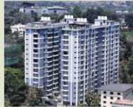
Silver Oak Residency 3&4 Bedroom Lavington