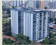
Diamond Oak Residency 3&4 Bedroom Lavington