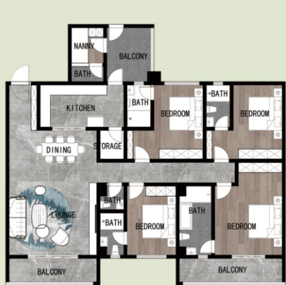
228 SQM (GROSS) 4 Bed All en-suite +Dsq