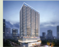
Oak Breeze Residency 1&2 Bedroom Kilimani (under construction)