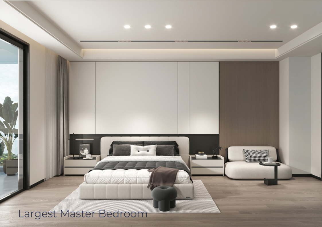
Largest Master Bedroom