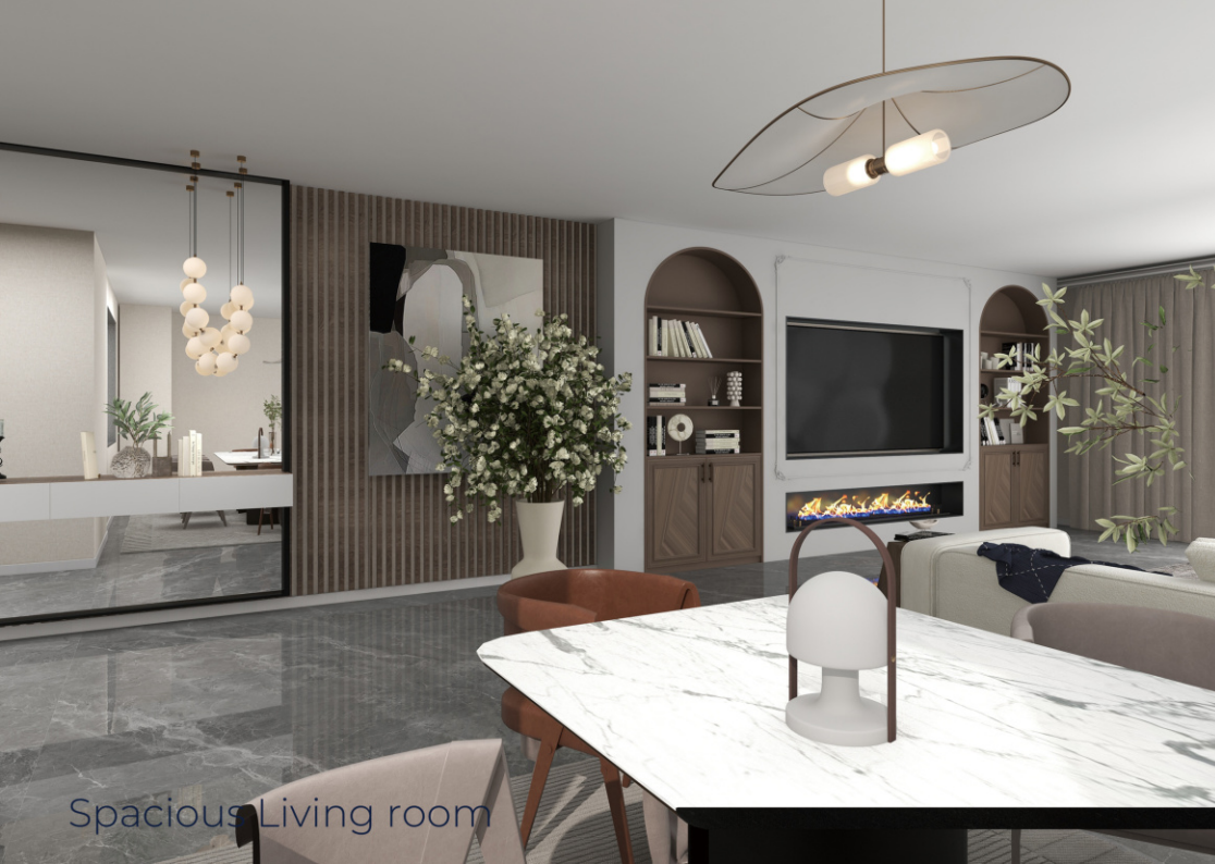
Spacious Living room