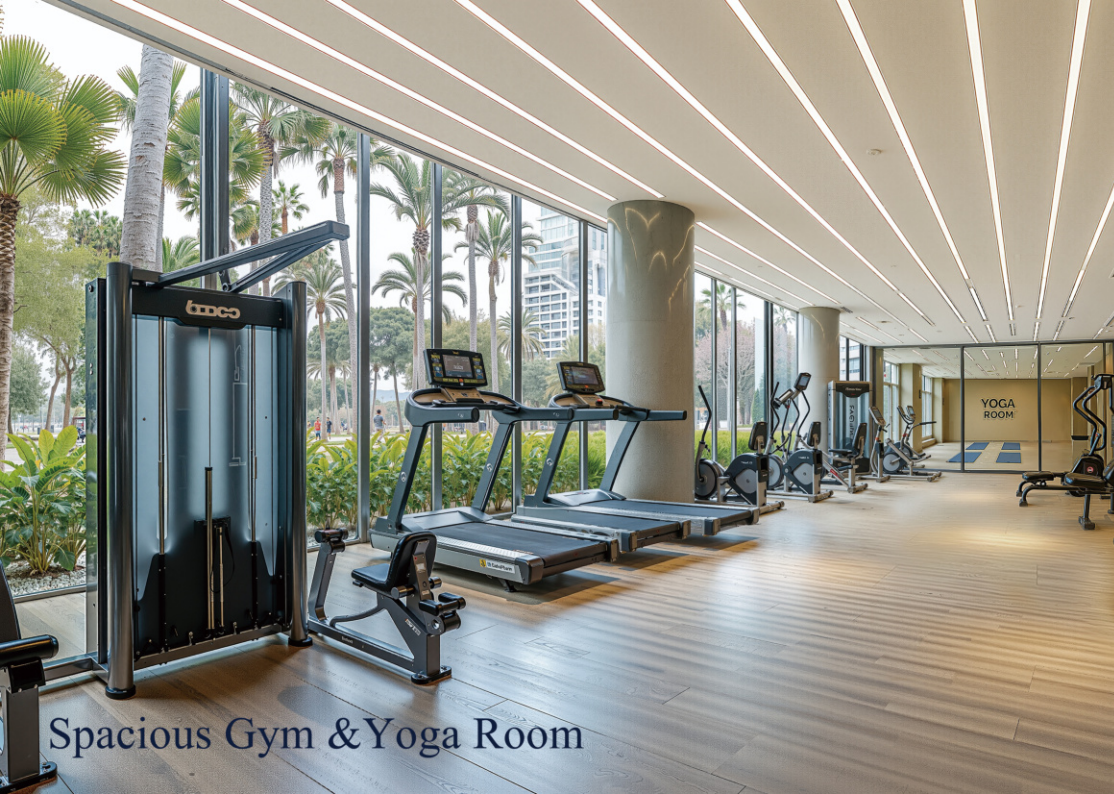
Spacious Gym & Yoga Room