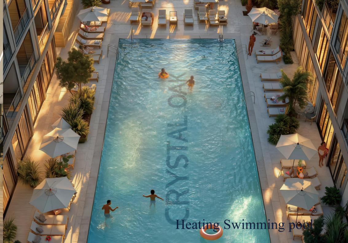
Heating Swimming pool