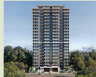
Venus Oak Residency 4 Bedroom Lavington (under construction)