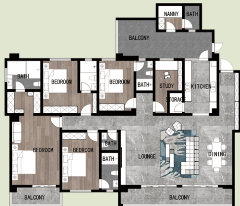
275 SQM (GROSS) All en-suite +Dsq+Study