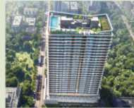
Oak West Residency 1&2&3 Bedroom Westlands (under construction)