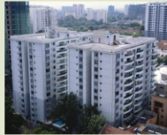
White Oak Residency 3&4 Bedroom Lavington