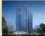
Crystal Oak Residency 3,4&5 Bedroom Lavington (under construction)