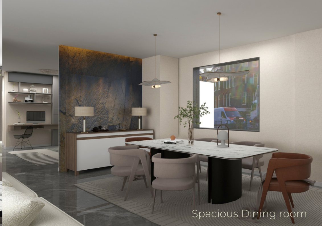
Spacious Dining room