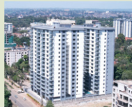
Platinum Oak Residency 4&5 Bedroom Kileleshwa