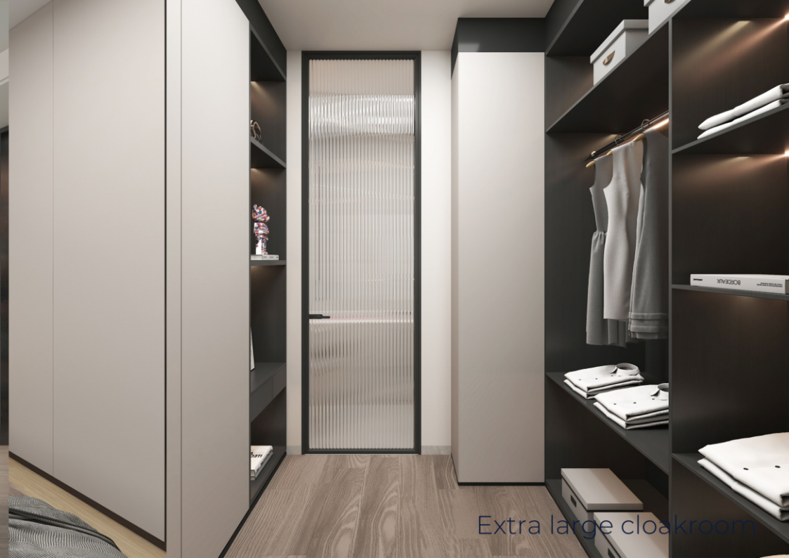
Extra large cloakroom