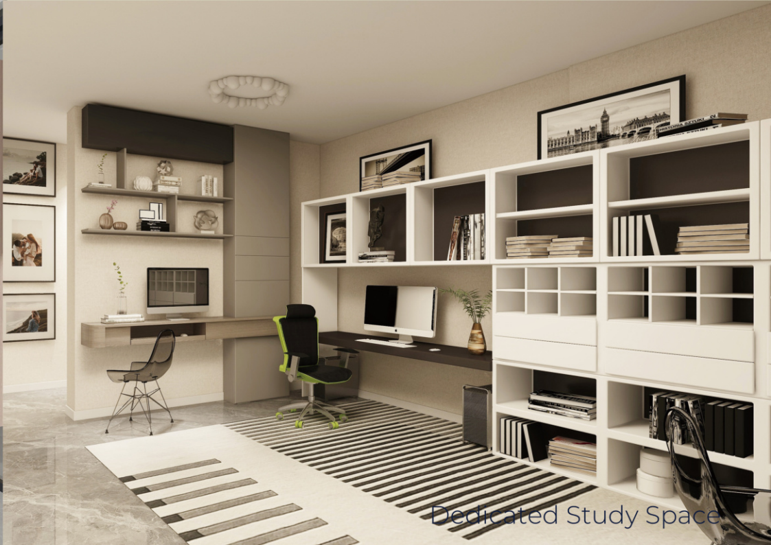
Dedicated Study Space